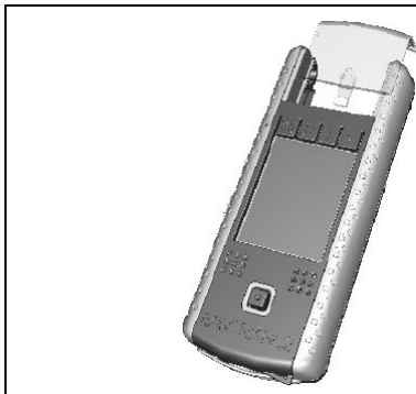
Figure 1. EvoPrimer base